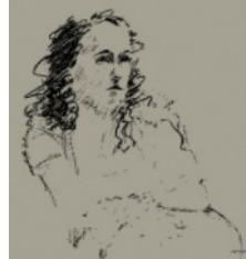
Figure Drawing on Thursdays