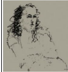
Figure Drawing on Thursdays