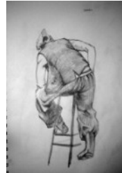
Figure Drawing on Thursdays